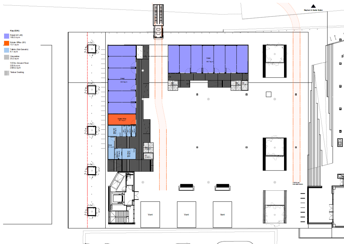
Proposed ground floor plan (Elephant Road at top of plan)