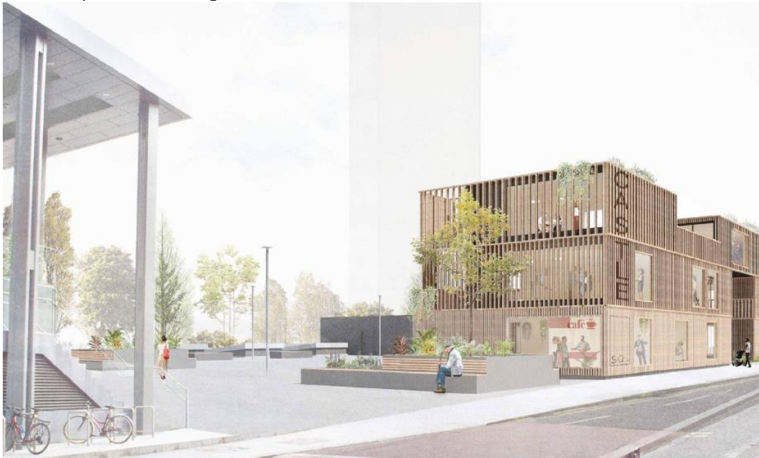
Proposed view from railway station