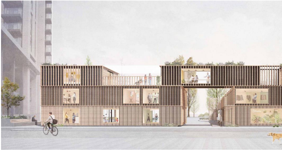
Proposed front elevation from Elephant Road